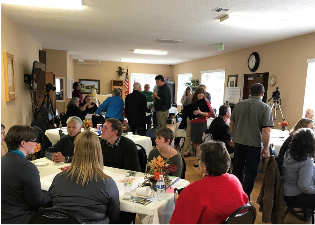
SHARING IDEAS AT THE KEY PENINSULA TRANSPORTATION SUMMIT

Need A Ride? Get A Ride. On the Key Peninsula