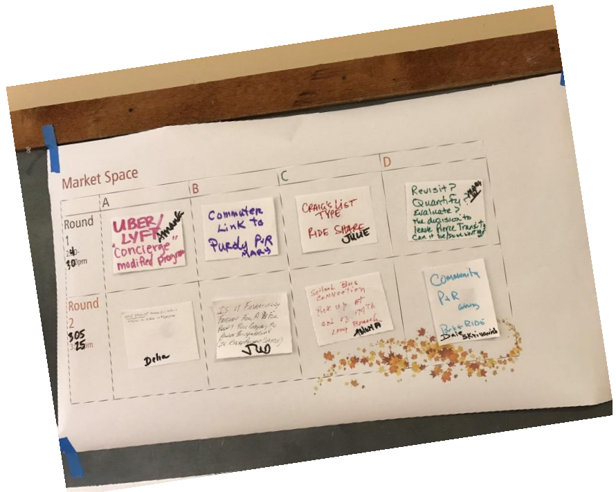
Community members place their transportation ideas in an "open market place" and host a discussion. The other community members participate in the topic of their choice.

Community members identified seven of the eight ideas that they would like to pursue now.